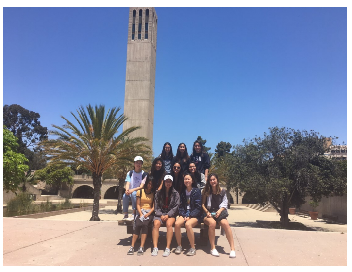
Troop 5325 High Schoolers at UCSB